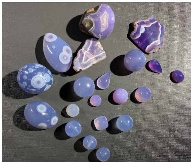
Figure 1: Purple to bluish grey chalcedony from Ethiopia. ring submitted to the Lab

In 2019, yet another gemstone deposit was discovered in Ethiopia, this time blue to purple chalcedony partly with an extraordinary saturated colour (Figure 1), which was introduced at the Tucson Gem show in 2022 (see also Furuya, 2022).