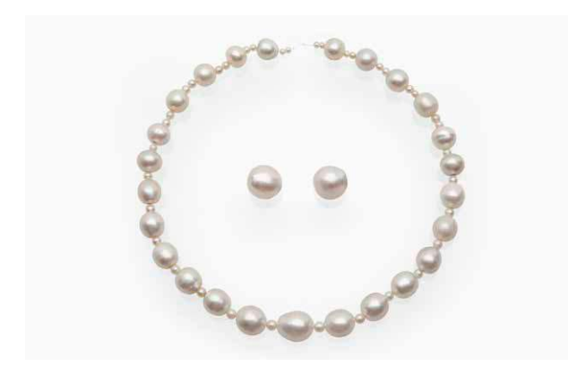
Figure 2: A pearl jewellery set that consisted of 63 natural pearls, with 61 of them being strung on a thread and two additional loose natural pearls.

A natural pearl set containing 63 natural pearls was studied extensively (Figure 2). Sixty of the natural pearls were of saltwater origin, three were of freshwater origin. Three saltwater natural pearls were randomly selected and further age dating and DNA fingerprinting analysis was carried out. One of the pearls was conclusively identified as being from the Pinctada radiata species (Persian Gulf & Ceylon pearl oyster), a species that can produce pearls commonly called 'Basra pearls' in the trade. The other two sampled pearls were attributed to another species: Pinctada persica or Pinctada margaritifera persica, which is a rare member of the Pinctada margaritifera species complex. To our best understanding, this is the first report of pearls originating from Pinctada persica. Until now, this species has been exclusively documented in the Persian Gulf (Ranjbar et al., 2016). Based on our data, they probably formed between the 16<sup>th</sup> and 18<sup>th</sup> century A.D. with the highest probability of