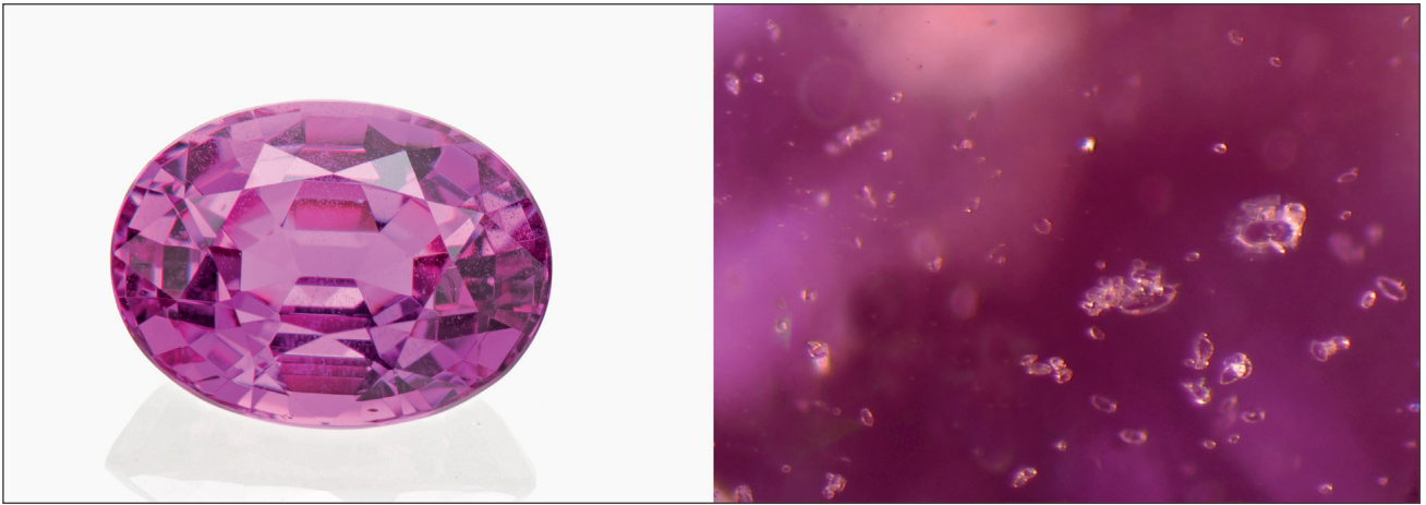
Figure 1: Pink sapphire of 7.9 ct from Ilakaka, Madagascar and photomicrograph of zircon inclusions (magnification 50x).