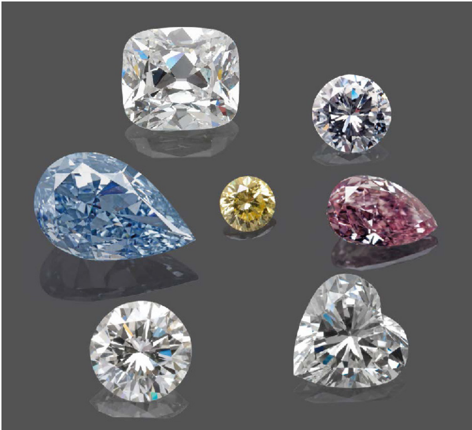
Figure 1: Seven colourless and fancy-colour diamonds (weighing up to 3.03 ct) of various natural or synthetic origins are shown here. The top-right and bottom-left round brilliants are HPHT- and CVD-grown, respectively, and the other diamonds are natural. The confident separation of natural and synthetic diamonds is critical to maintaining consumer confidence in the trade.

Wang et al. (2014) used SIMS to investigate carbon isotopes in both natural and CVD synthetic diamonds. The current study includes HPHT synthetics along with CVD and natural samples.