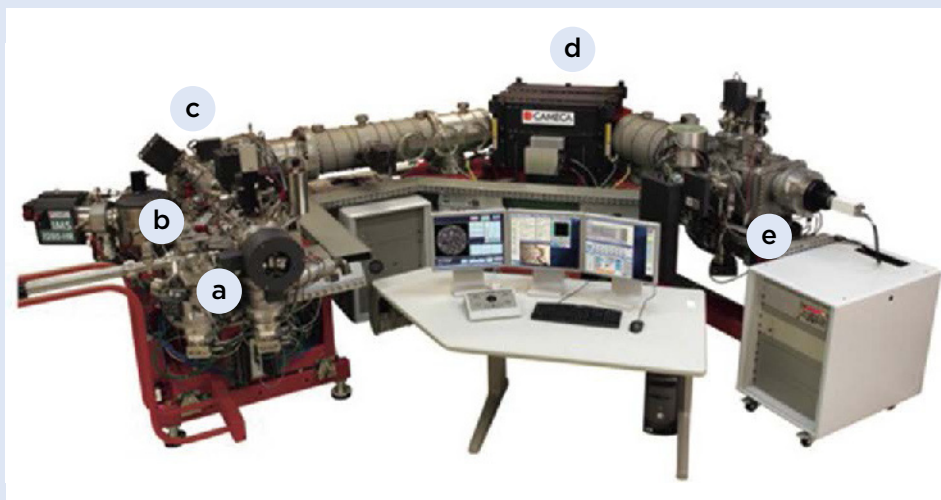
Figure 2: The SIMS instrument (Cameca IMS 1280-HR) at the SwissSIMS facility of the University of Lausanne consists of the following components: (a) sample chamber, (b) primary ion source, (c) electrostatic analyser, (d) magnet and (e) detection unit.

The carbon isotopes in our samples were measured using a Cameca IMS 1280-HR instrument (Figure 2) at the SwissSIMS facility of the Institute of Earth Sciences at the University of Lausanne, Switzerland (Seitz et al., 2017; Siron et al., 2017). We used a 10 kV \text{Cs}^+ primary beam and an \sim 0.6 nA current, resulting in an \sim 10 \mu\text{m} rastered beam size. An electron flood gun, with normal incidence, was used to compensate charges. We gathered ^{12}\text{C}^- and ^{13}\text{C}^- secondary ions, accelerated at 10 kV, in multi-collection mode using a Faraday cup (for ^{12}\text{C}^- ) and an electron multiplier (for ^{13}\text{C}^- ). A mass resolving power of \sim 6,000 was achieved, to overcome polyatomic interference of ^{13}\text{C}^- with ^{12}\text{CH}^- , for example (Fitzsimons et al., 1999). The Faraday cup was calibrated at the beginning of the session. Each spot analysis took \sim 7 minutes, including pre-sputtering (60 seconds) and automated centring of secondary ions. The results of the analyses were expressed as the isotopic signature \delta^{13}\text{C} , which is a measure of the ratio of the isotopes ^{13}\text{C}/^{12}\text{C} , reported in parts per thousand (per mil, ‰).