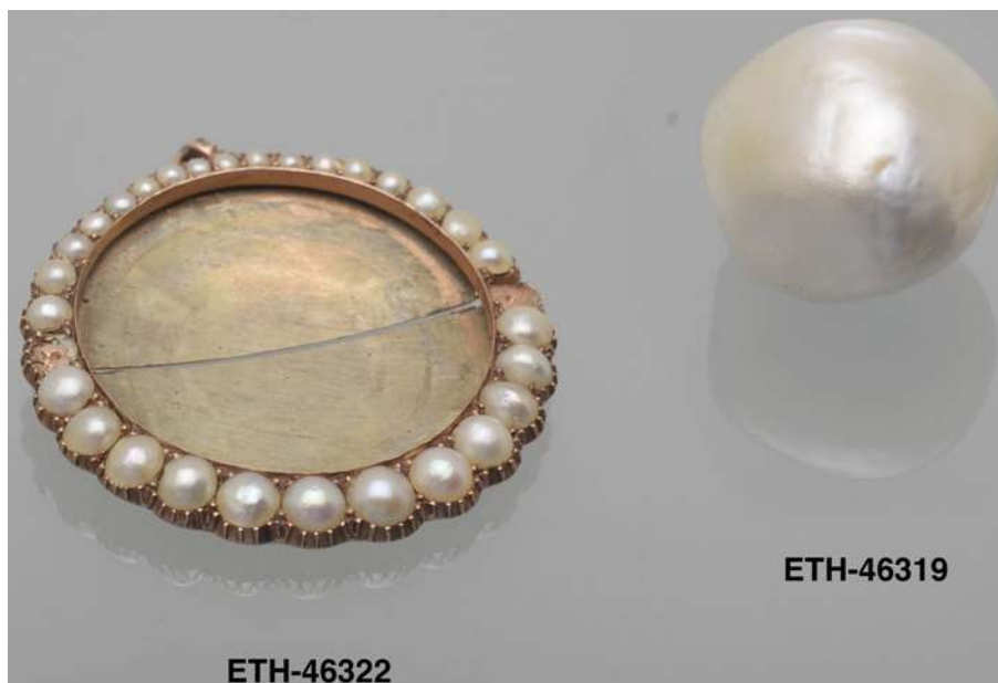
Figure 3 Two of the analyzed samples: ETH-46322, a pearl from an antique medallion-pendant with small pearls from 1860 (species Pinctada radiata from the Arabian Gulf), and sample ETH-46319, a large natural pearl ( Pinctada maxima , presumably from northern Australia) with a pre-1950 age.

and ETH-46323). Based on the provided information and the analyzed properties, the authors have designated a geographic area to all of the samples to our best knowledge (Table 1).