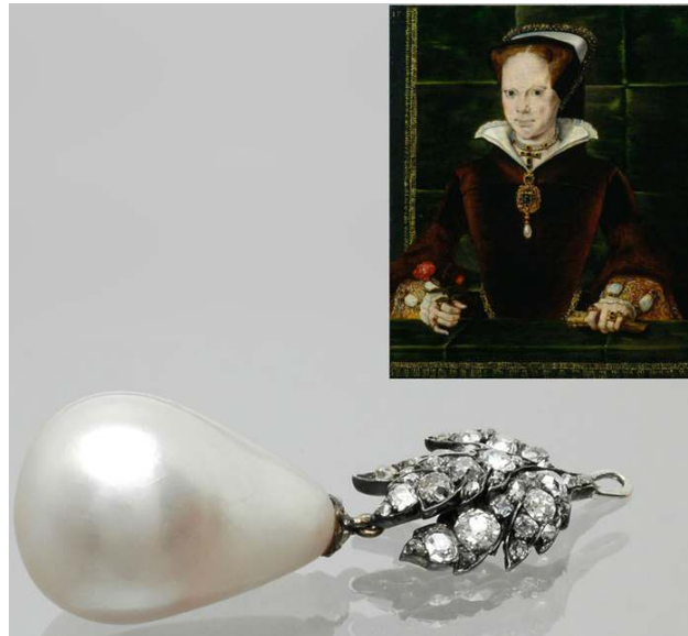
Figure 1 La Peregrina pearl, a historic natural pearl found in the 16th century and which has been depicted in several historic paintings (inset: painting by Hans Eworth (~1520–1574) of Queen Mary I of England and Ireland, wearing a pendant with the La Peregrina pearl).