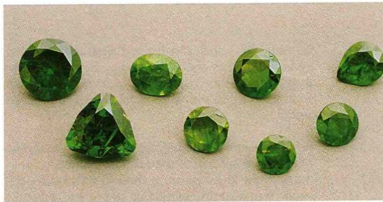
Figure 1. These demantoid garnets (0.55 to 3.06 ct) from the Ural Mountains of Russia were among those studied for this article.

identification, the spectra were compared to reference samples to make a positive identification.