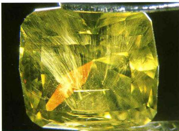
Figure 2. When observed with magnification, the straight, colorless diopside needles appeared very different from the curved chrysotile fibers ("horsetails") typically seen in Russian demantoid garnet. magnified 30×.

Each stone was examined with a gemological microscope and darkfield illumination at 10×–50× magnification. The inclusions were analyzed with a Renishaw Raman system, using a 514 nm argon laser and an Olympus gemological microscope at 20× magnification to focus the laser on the inclusion. For each analysis, 20 scans (5 seconds/scan) were accumulated. On the basis of a preliminary computerized